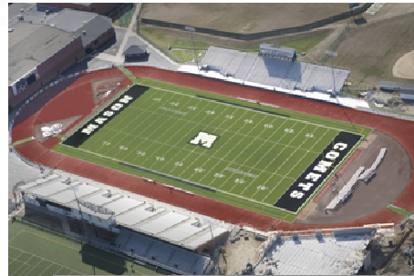
Dwire Field at Atrium Stadium